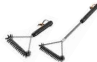
3 Sided Grill Brushes Makes it easy to get between the grill bars and other difficult places. 6494 - Small 6493 - Large