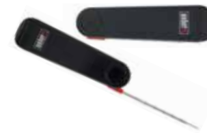
Snapcheck™ Grilling Thermometer Super-fast and accurate to within 1°C. The Snapcheck thermometer is the ultimate instant thermometer. 6752