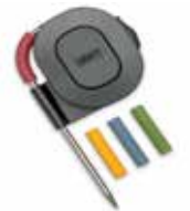
iGrill® Probe Either replace an existing meat probe or add a couple more to your iGrill 2. 7211