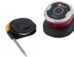
iGrill mini Take the guesswork out of barbecuing with the iGrill Mini digital Bluetooth® thermometer. 7202