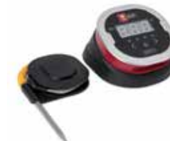
iGrill 2 Featuring a digital LCD display, total control of your barbecue meals has never been easier. 7203