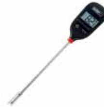
Instant Read Thermometer The large digital display reads the internal meat temperature accurately in a matter of seconds. 6750

For the complete range of Weber accessories visit www.weber.com/au