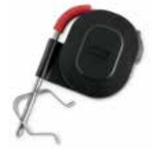
iGrill Ambient Probe This durable, stainless steel probe clips onto your grill to provide exact ambient temperature tracking. 7212