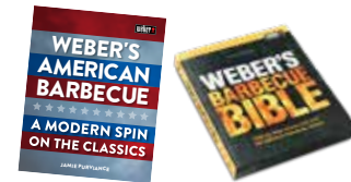
Cookbooks 991166 Weber's American Barbecue 991165 Weber's Barbecue Bible